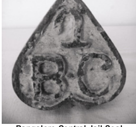
Bangalore Central Jail Seal

The new Freedom Park, created at the site of Bangalore's old Central Jail, is to include a Jail Museum which will offer a journey into the history of the old jail, and contrast this with more current representations of prison life in Karnataka State Prisons today.